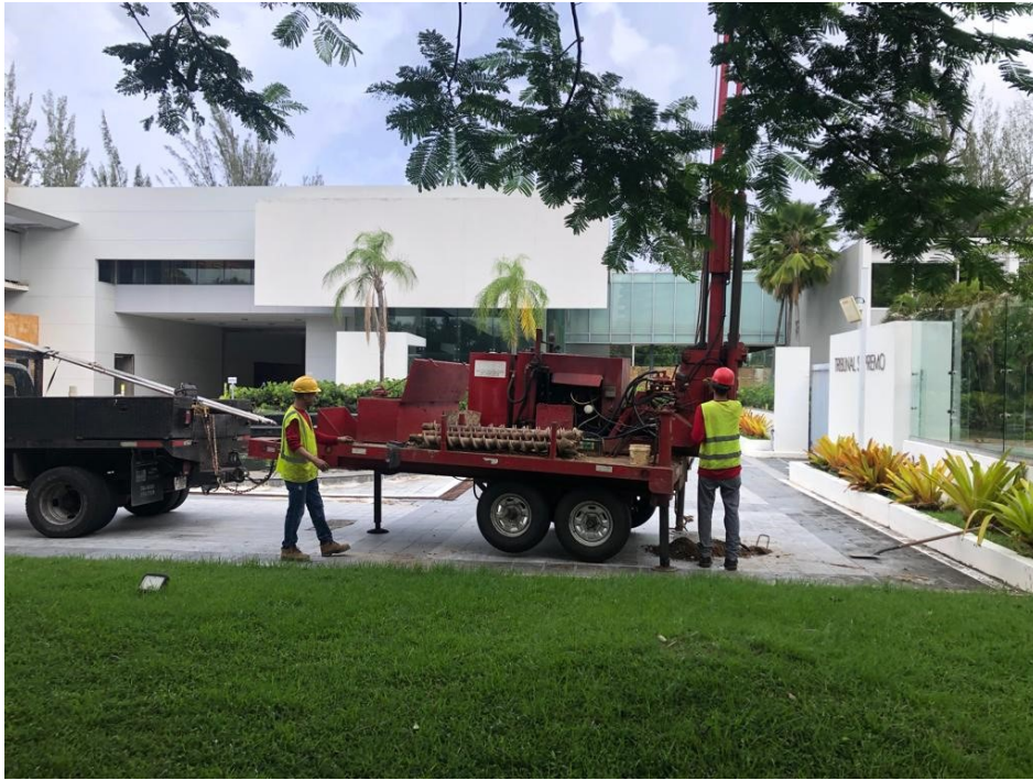
BORING # 1