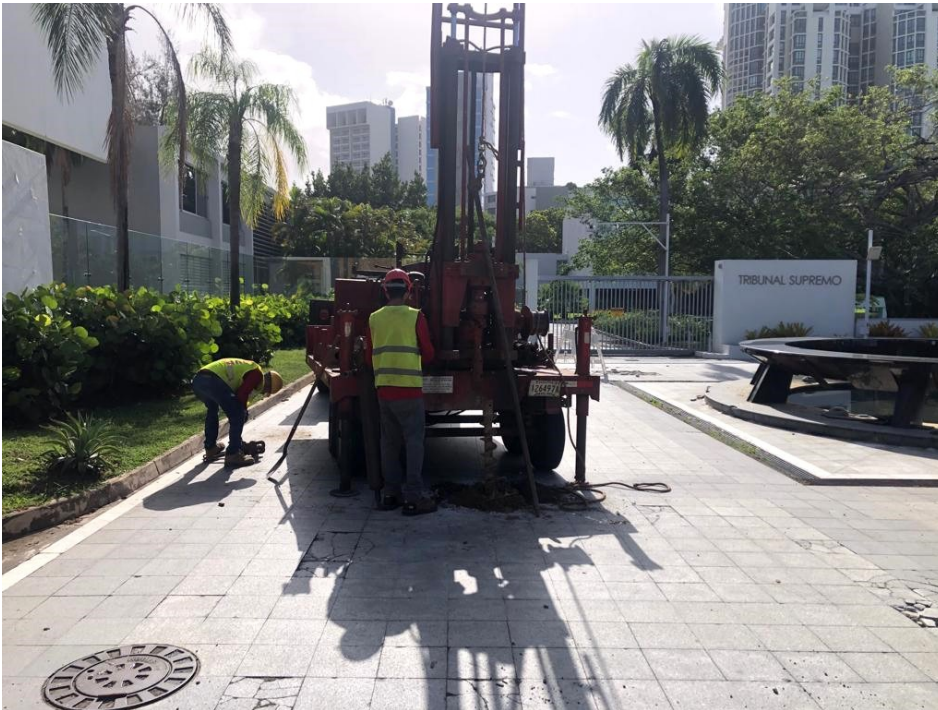
BORING # 2